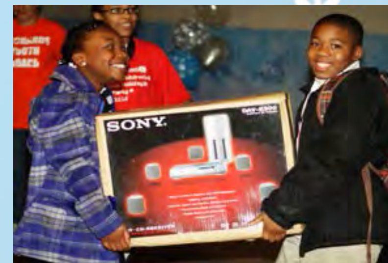
Above: The children are overjoyed with the gift the family won at the holiday party.

More than 700 people attended Orchards' annual holiday party, which was held at Forgotten Harvest. There was dancing, face painting, arts and crafts, cookie decorating, food, and plenty of giveaways. In addition to Ms. Claus and several elves, Rudolph also visited Santa in his own private candyland room! Thanks to Chrysler LLC, our presenting sponsor, and Forgotten Harvest for donating their facilities. A good time was indeed had by all.