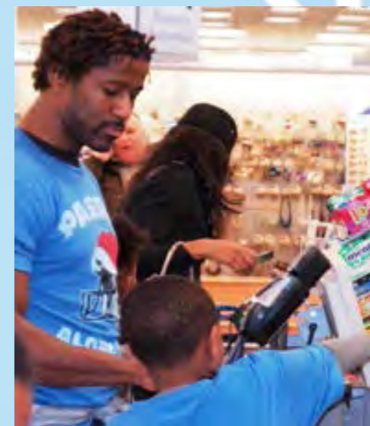
Right: The Lions' Nate Burleson is intent as he assists children at the checkout line.