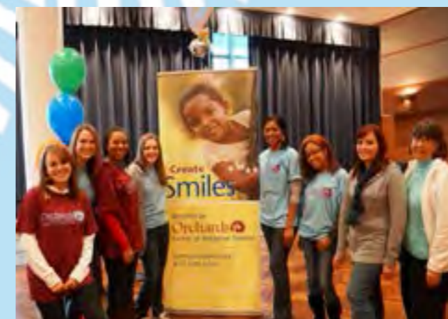
Above: Orchards' staff volunteered at Cobo Hall and helped create smiles for 3,000 children at the Annual Adopt a Child event.

Our children also participated in Variety and Automotive Credit Corporation Bike Giveaways, wherein they received a total of 50 bikes. Also, Al Serra Automotive in Genesse County and the Washtenaw Department of Corrections hosted shopping trips for some of our children in those counties. Christian Fellowship Church sponsored 30 children and gave them numerous gifts.