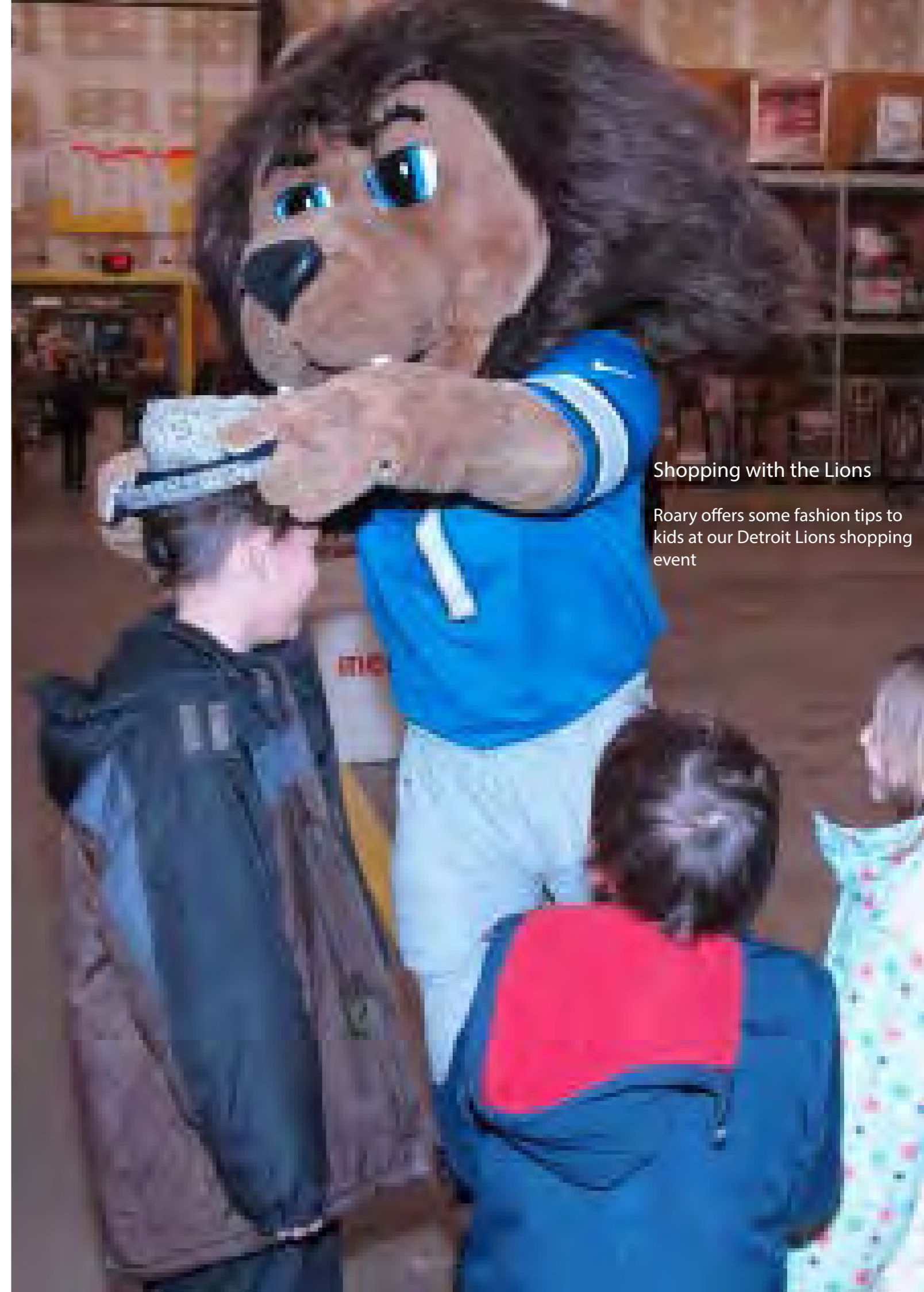
Shopping with the Lions