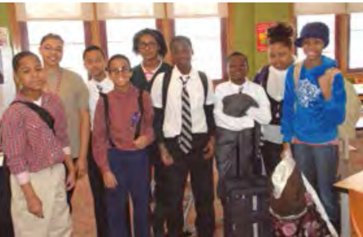
Pictured here are Learn2Learn participants at Ludington Middle School in Detroit.

Our belief in the value of education is as strong as ever. In May, our agency partnered with DHS in their Pathways to Potential program in the Flint, Pontiac and Detroit schools. We met with all the Success Coaches in these schools who are now delivering services to parents. We have taken referrals to provide in-home visitation services so that these families can maximize the benefits received from workers housed in the schools. This also allows us to coordinate the education their children receive in order to prepare them for a bright future.