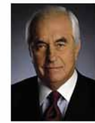
Roger Penske Chairperson