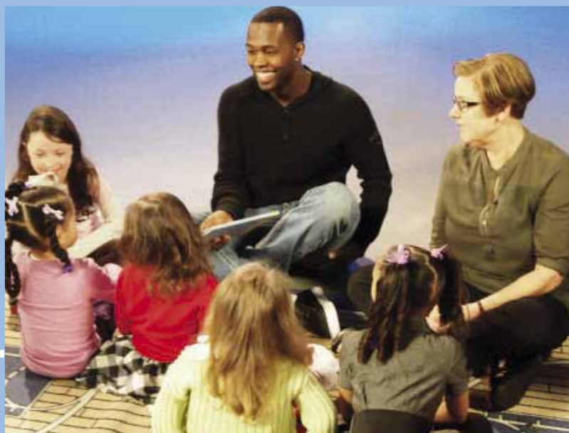
Detroit Piston Rodney Stuckey and his mom support Orchards!